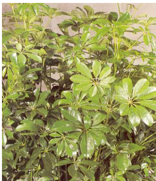
Schefflera arboricola Hawaiian Schefflera