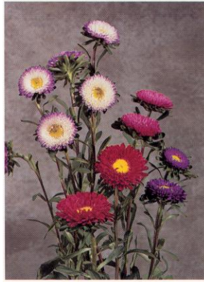
Callistephus chinensis China aster