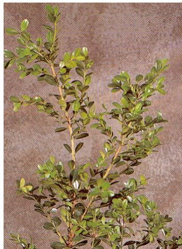
Buxus sempervirens Boxwood