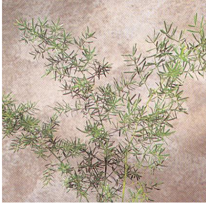
Asparagus densiflorus 'Sprengerii' Sprengerii Asparagus fern